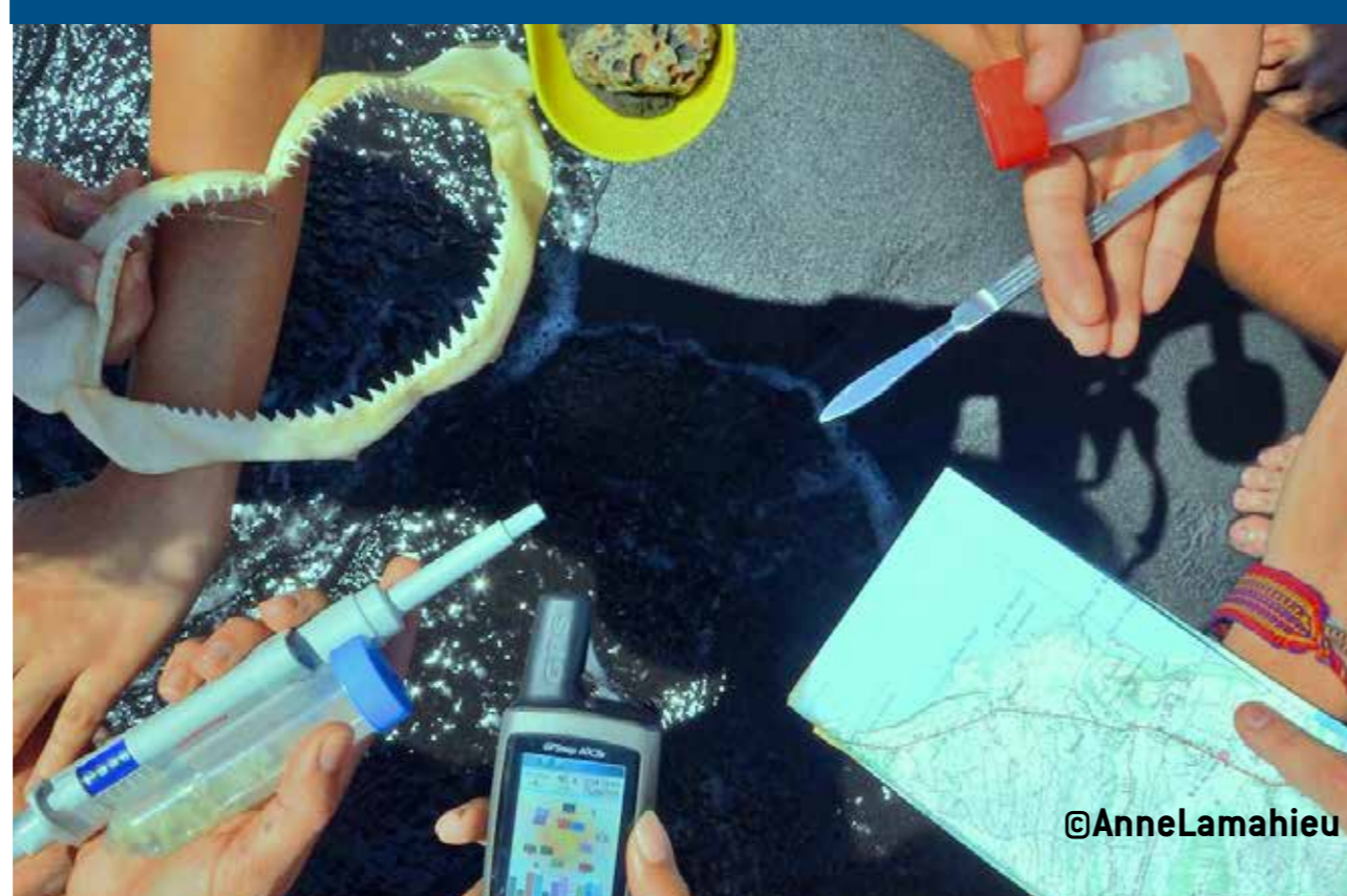
Delivering best practices and lessons through innovative ocean governance demonstration