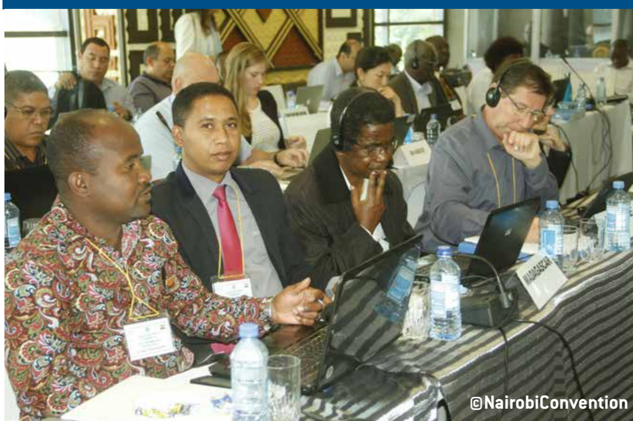
Supporting policy harmonization and management reforms to improve ocean governance