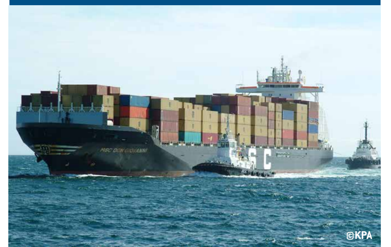
Stress reduction through private sector/industry commitment to transformations in their operations and management practices