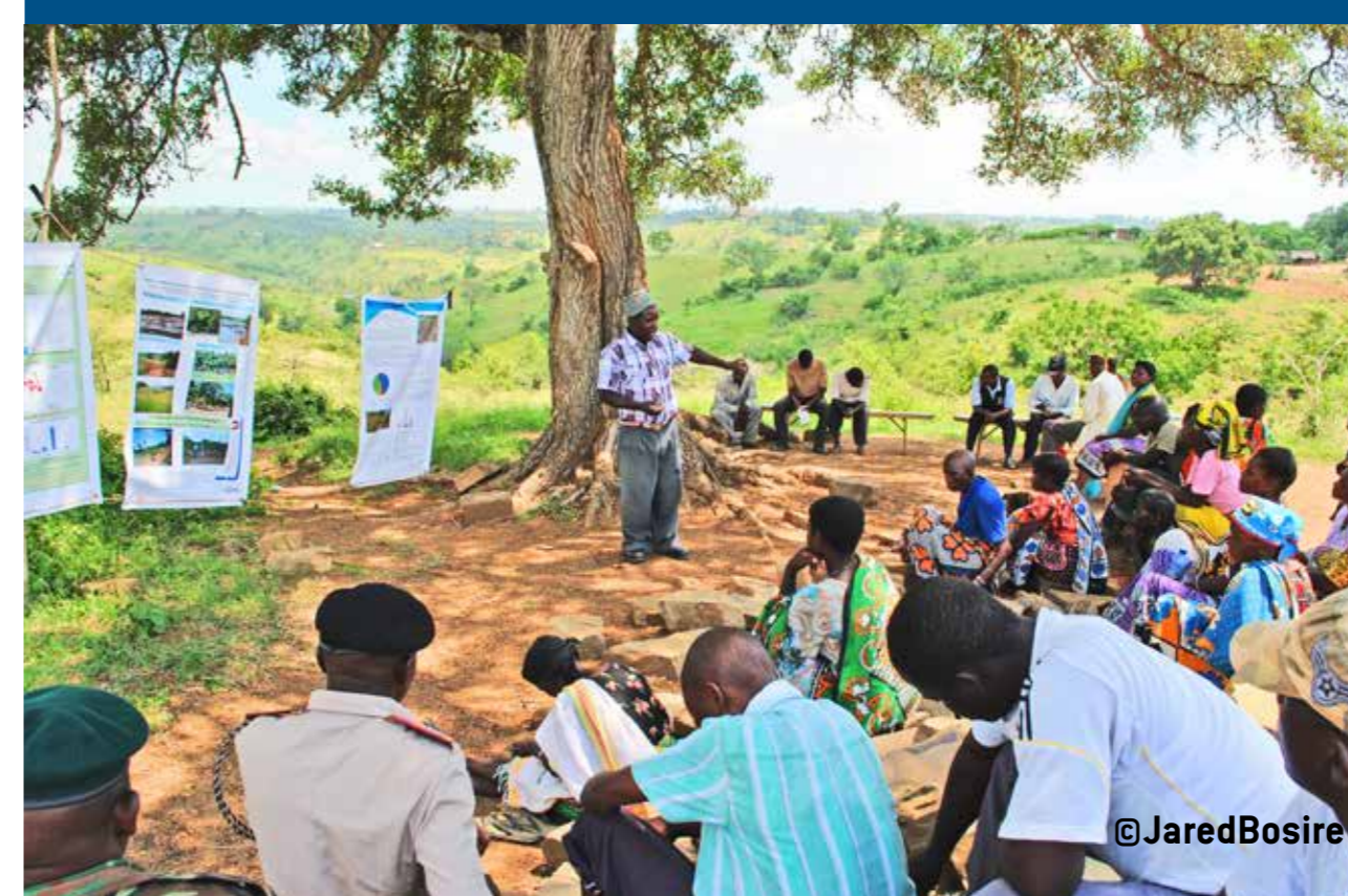
Capacity development to realise improved ocean governance in the WIO region