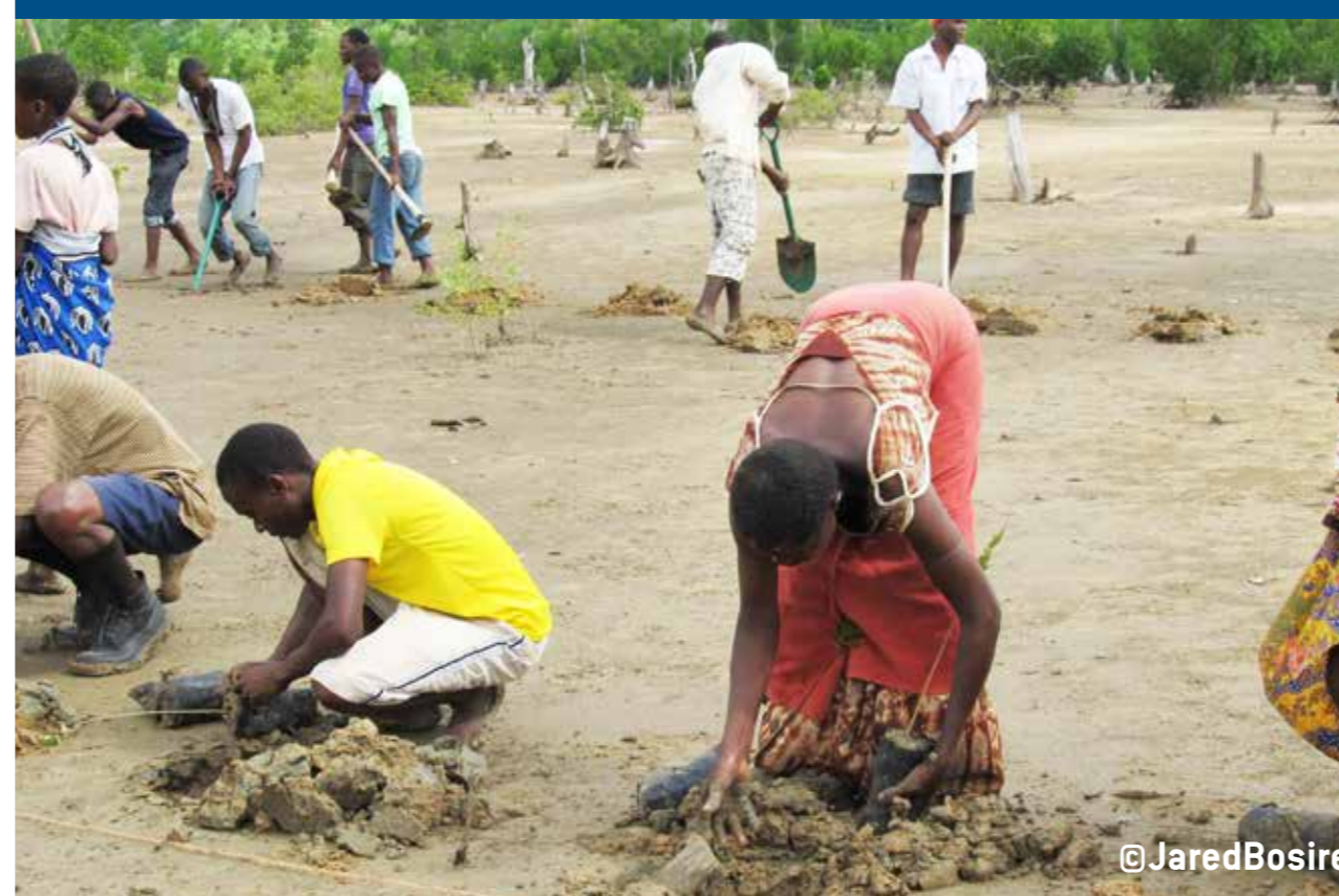
Stress reduction through community engagement and empowerment in sustainable resources management