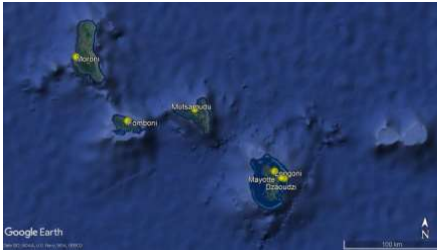
Figure 2.1 Location of documented ports in Union of Comoros (see Table 2.1 for more details)