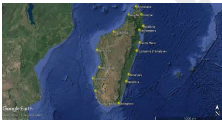
Figure 2.3 Location of documented ports in Madagascar (see Table 2.1 for more details)

Madagascar has a network of 17 seaports including Toamasina, Antsiranana, Nosy Be, Mahajanga, Toliara, Antalaha, Vohémar, Morondava, Tolagnaro, Morombe, Manakara, Maintirano, Sainte Marie, Maroantsetra and Antalaha (Figure 2.3) (Two other in rivers - Port Saint Louis and Antsohihy). Five of these ports (Antsiranana, Toliara, Vohémar, Toamasina, Tolagnaro) have adequate port facilities: wharves, drafts, land, shops, handlers, allowing commercial loading and unloading of goods at the dock ( https://dlca.logcluster.org/ ). Major expansions are planned at Tamatave where trade is expected to triple after full delivery of the port extension in 2025 ( www.lejournaldesarchipels.com/2021/05/13/port-of-tamatave-an-extension-to-640-million-dollars/?lang=en ).