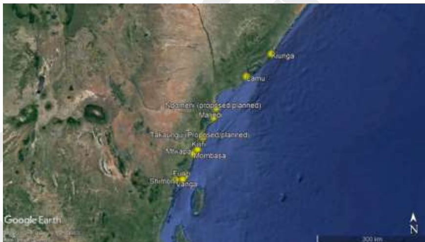
Figure 2.2 Location of documented ports in Kenya (see Table 2.1 for more details)

Kenya's major ports are in Mombasa, Malindi and Lamu, with smaller ports at Kiunga, Kilifi, Mtwapa, Funzi, Shimoni and Vanga (Figure 2.2). Ngomeni and Takaungu have been considered for future port development, with major expansion also planned for Lamu ( https://www.kpa.co.ke/ ).