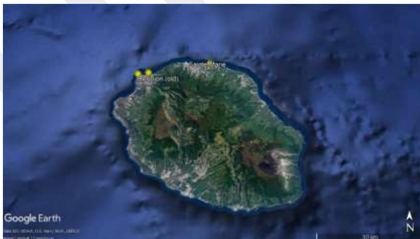
Figure 2.6 Location of documented ports in Réunion (see Table 2.1 for more details)

The main commercial port of Reunion, Port Réunion, comprise Ouest Port (old port) and Est Port (new port). A smaller port, Port de Sainte-Marie is in the north of the island in a marina development (Figure 2.6 and Table 2.1).