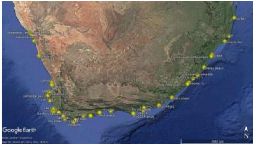
Figure 2.9 Location of documented ports in South Africa (see Table 2.1 for more details)