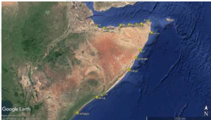
Figure 2.8 Location of documented ports in Somalia (see Table 2.1 for more details)

The main ports of Somalia are situated at Mogadishu, Kismayo, Bossaso, and Berbera (Somaliland) (Figure 2.8 and Table 2.1) ( somalitalk.com/2010/may/istambul/transport.pdf ). Smaller ports (or jetties) are located El Maan, Lughaya, Alula, Hafun, Eyl, Gracad, Hoby, Merca, Qandala, and Maydh and Las Khorey Somaliland).