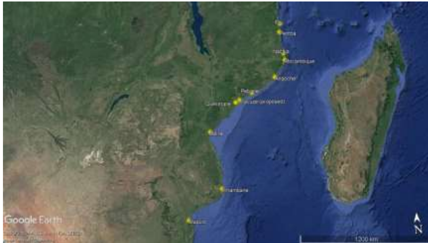
Figure 2.5 Location of documented ports in Mozambique (see Table 2.1 for more details)

Mozambique has three main ports at Maputo, Beira and Nacala. Other smaller ports exist, such as Ibo, Pemba, Mocimboa do Congo, Angoche, Pebane, Quelimane and Inhambane (Figure 2.5 and Table 2.1) ( https://dlca.logcluster.org/ ). The construction of a new deep water port at Macuze in the Zambézia province, is expected to start in 2021 ( https://furtherafrica.com/2020/03/17/construction-of-the-port-of-macuse-in-mozambique-starts-in-2021/ ; https://global.royalhaskoningdhv.com/projects/owners-engineer-for-the-moatize-macuze-railway-and-port-project ).