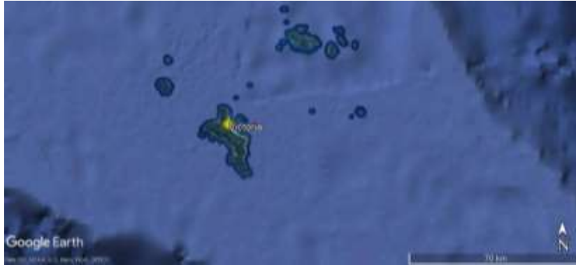
Figure 2.7 Location of documented ports in Seychelles (see Table 2.1 for more details)

Port Victoria is the main multi-purpose port of the Seychelles situated on the Island of Mahé and managed by the Seychelles Port Authority (SPA) that was Seychelles Ports Authority Act (2004) ( http://www.seyport.sc/ ) (Figure 2.7 and Table 2.1).